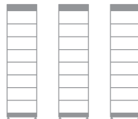
3 x HVM 22.1